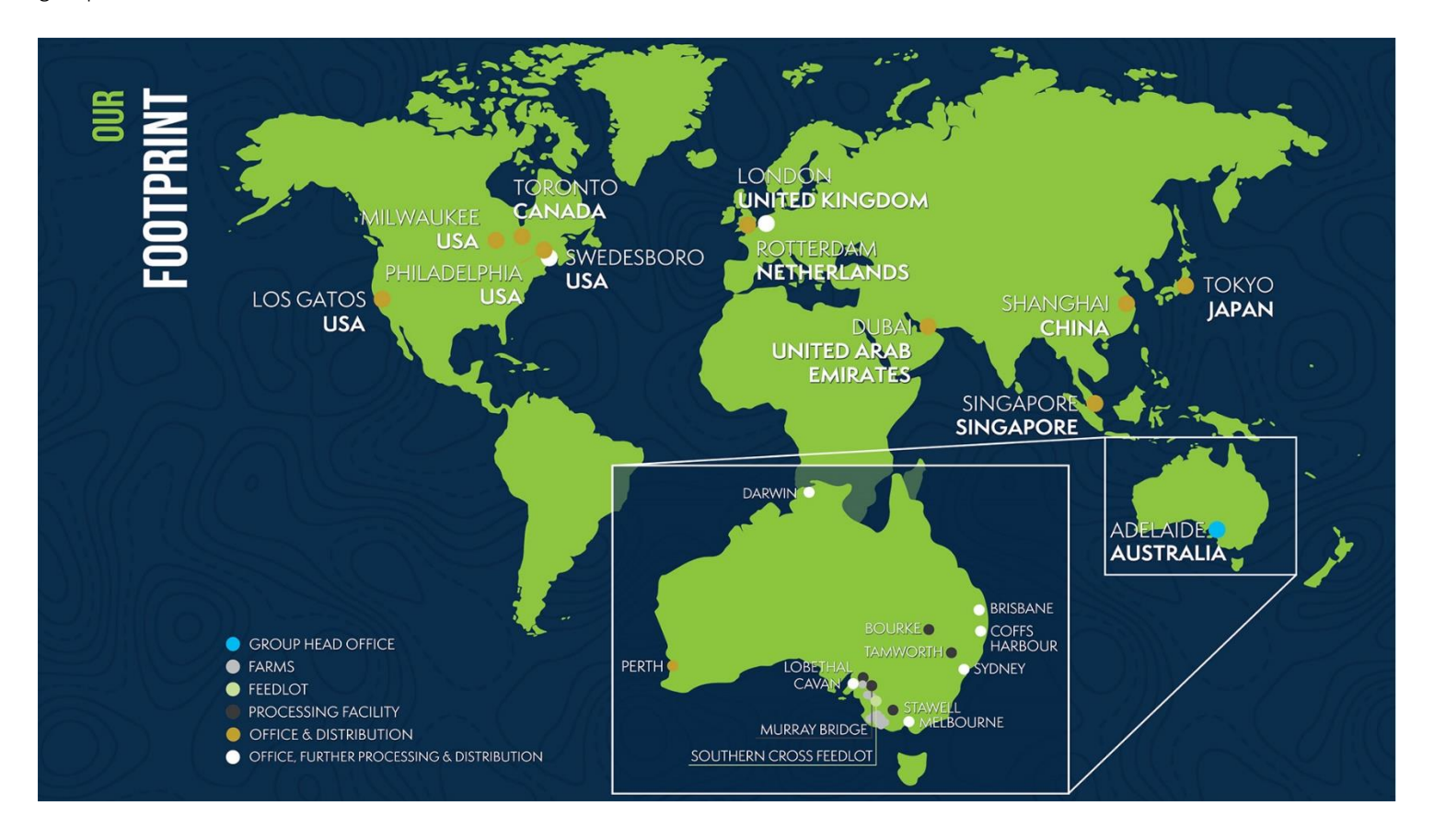
Figure 1. TFIC group Australian and international locations

TFIC is the parent entity of the TFIC group of companies, with primary production and processing operations based in Australia . Our supply operations (i.e., secondary processing operations, sales and distribution operations) ( Figure 2 ) are located throughout Australia, the United States, Canada, China, Japan, Singapore, the Netherlands, the UAE, and the United Kingdom ( Figure 1 ).